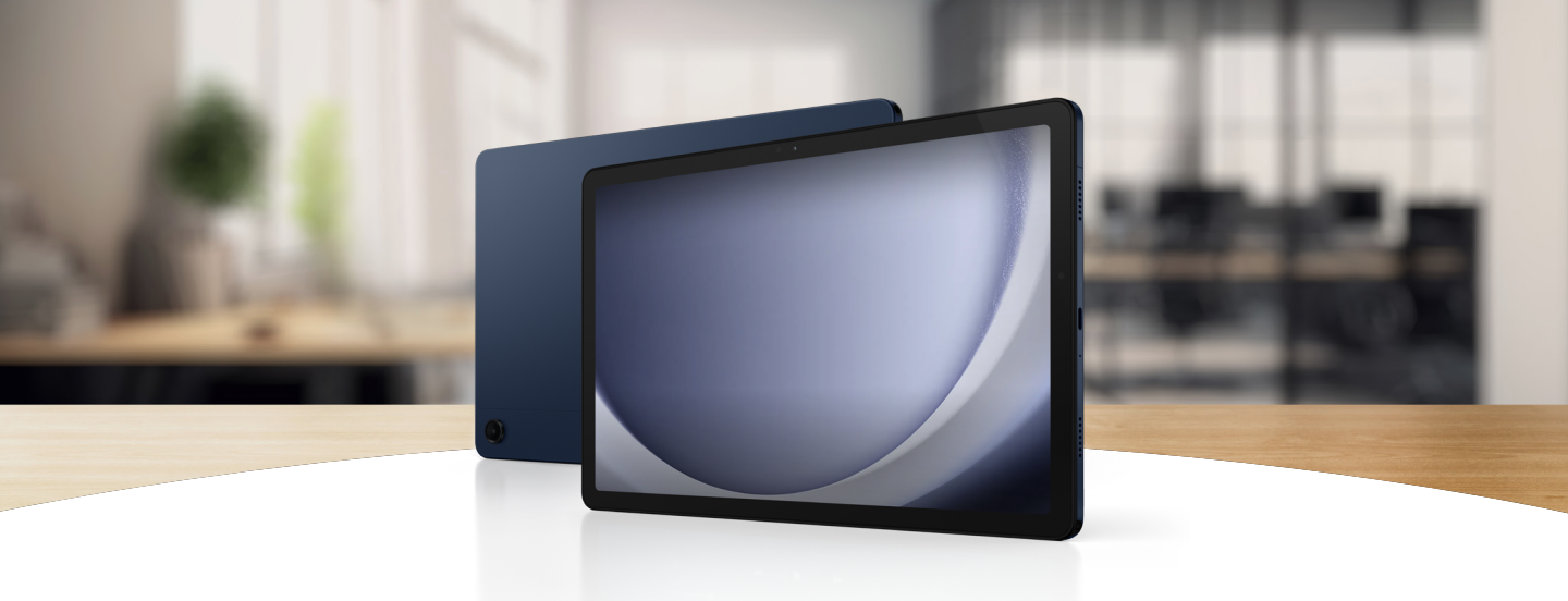
Tab A9+ ('23)